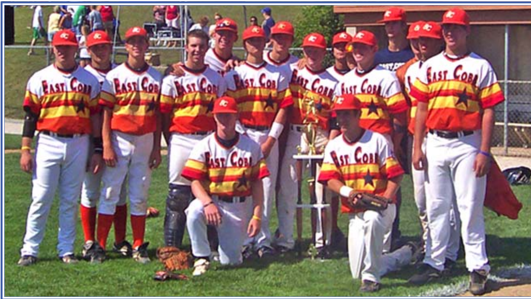
Continental Amateur Baseball Association 2009 15 and Under CABA World Series Held In Northern Illinois, July 24 - August 1, 2009 15 age Division CABA World Series Champions East Cobb, Georgia Astros